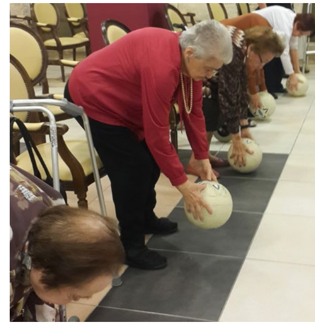
The eight-week program was progressive in nature, and testing at completion revealed marked increases in participants' strength and conditioning.

Throughout the course of the study, there were no reports of any injuries or negative repercussions. Thus, this study supports that CrossFit is safe and well tolerated in healthy older adults even in the eighth and ninth decades of life. It can prove challenging to provide the necessary individual attention and meet the needs of the individual while tending to a large class, so I suggest that initially older adults-especially those starting from sedentary lifestyles-should start training individually or in small groups until they can master the basic movements and reach a fitness level that allows them to join a class.