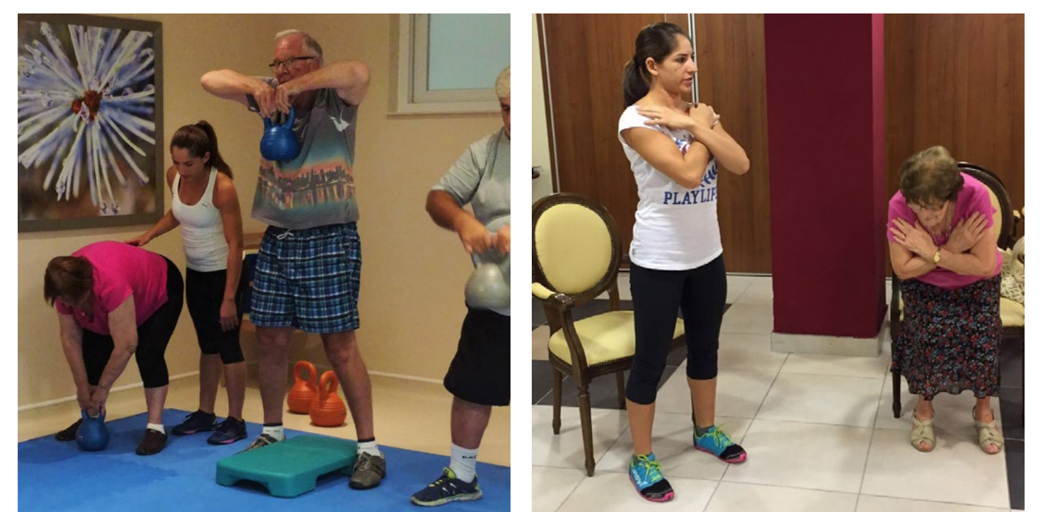
All sessions included a dynamic warm-up, skill/strength work, a conditioning component and stretching.

The participants' level of functional fitness was measured before and at the end of the intervention using the Senior Fitness Test. which is composed of a battery of test items specifically designed to assess the four physical parameters identified as being the relevant components of functional fitness in older adults (24): muscular strength, aerobic endurance, flexibility, and agility and dynamic balance. After completing the exercise program, parti-