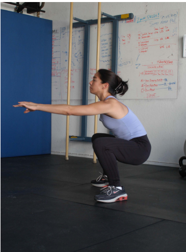
Losing Lumbar Extension (rounding the back - this may be the worst)