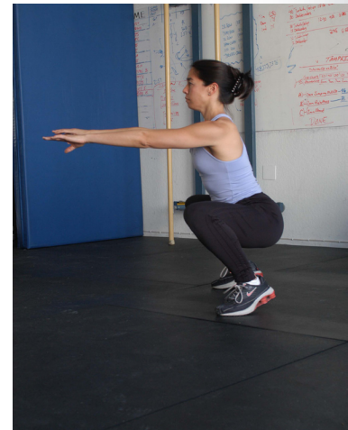
Heels Off the Ground

A relatively small angle of hip extension (flat back), while indicative of a beginner's or weak squat, and caused by weak hip extensors is not strictly considered a fault as long as the lumbar spine is in extension.