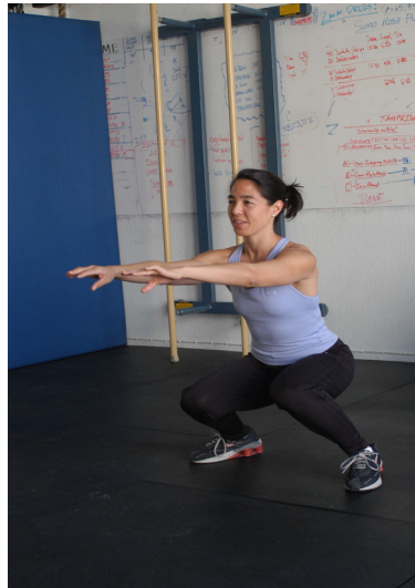
Rolling Knees Inside Feet