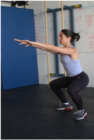
Not Breaking the Parallel Plane