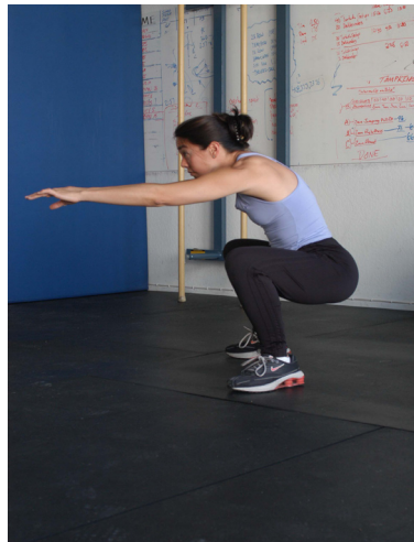
Dropping the Shoulders