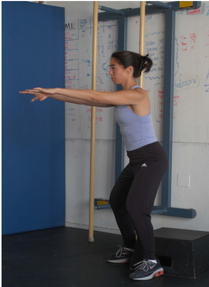
Not Finishing the Squat - not completing hip extension