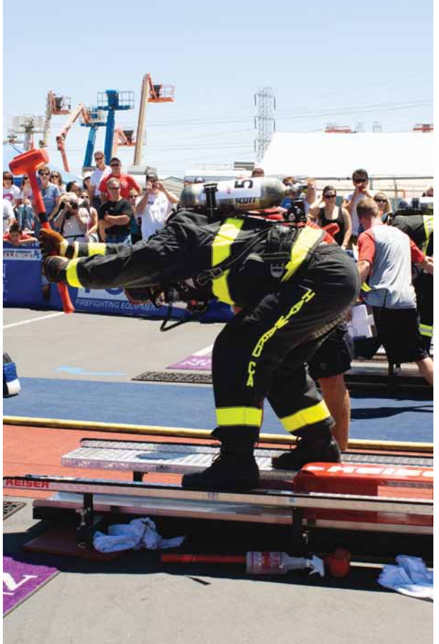
Globo Gym can't help you: functional fitness is required to do well in the Firefighter Combat Challenge.

Suddenly the blackboard near the drill tower was full of names and times, with elite firefighters attempting to best their brethren on the gruelling course.