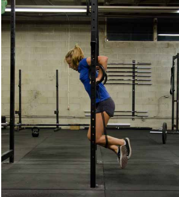
Tempting as it may be, don't overdo it on assistance work on light day.

The reasoning behind doing just three primary movements, rather than four, five or six, is that once the athlete has perfected his form on the basic lifts—bench, squat, power clean—he can move on to other exercises more readily. This is particularly true for the power clean. Learn how to do that properly and there's no trouble picking up the form for high pulls, power snatches, full cleans and snatches, and power shrugs.