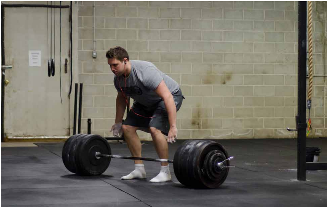
On heavy day, it's time to load up and go big.

This method greatly simplifies the process of weight selection, and the athletes can do the calculations for the week themselves, allowing the coaches to spend more time teaching technique.