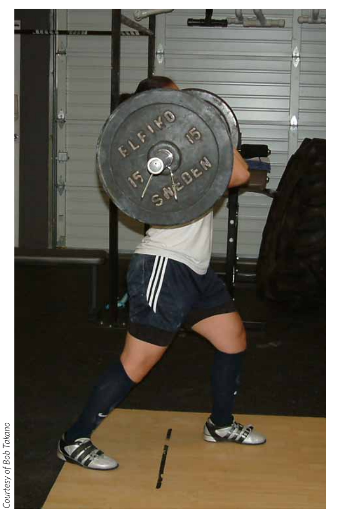
The starting position for the jerk balance. The lead foot should be about 30 centimeters in front of the back foot.

There are several problems that plague many athletes who find it difficult to master the split jerk. Some athletes have only one of these problems, whereas the unfortunate ones may have difficulty with two or more. In this article I intend to explore these problems and their causes, as well as their remedies. The squat jerk will not be covered as so few have the ability to perform it properly.