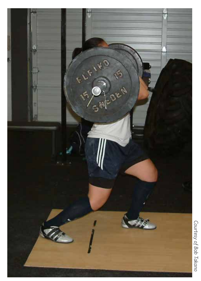
The dip stage of the jerk balance. From here, the athlete drives the bar overhead and finishes by moving the feet further apart.