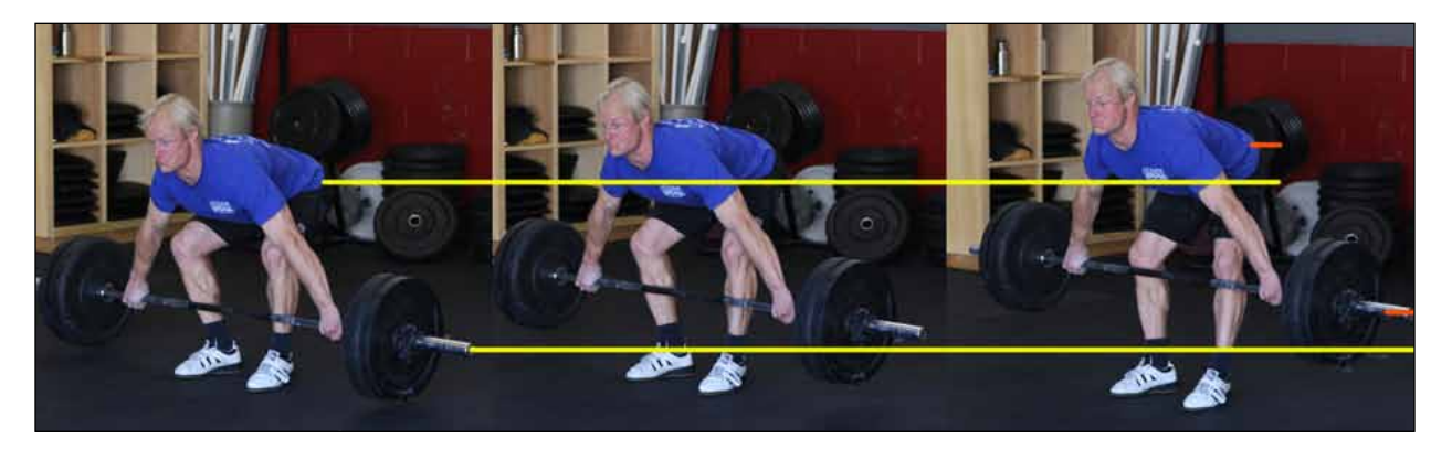
Notice that the bar and hips rise at the same rate, the back angle doesn't change, and the bar stays in contact with the shins.

CrossFit is a registered trademark of CrossFit, Inc. © 2008 All rights reserved.