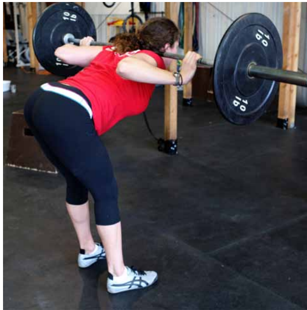
Good mornings are a key part of a beginner's Oly program.

Back squats need to be done with the bar set high on your traps and not low on the back as many powerlifters prefer. You can't lean at all on the back squats if you want the power gained to be utilized in the clean and snatch. On Monday, do 5 sets of 5 and work to max. On Friday, use this formula: 3 sets of 5, then 2 sets of 3. The final set on Friday should be 5 or 10 lb. heavier than your final set of 5 on Monday. The next Monday will find you using the same weight from your last set of 3 on Friday, but you'll do 5 reps with it. In that manner, the numbers will steadily climb upward on your back squat.