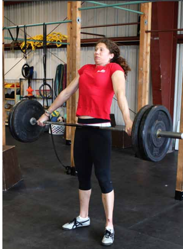
Snatch-grip shrugs (bottom) are one of the exercises Bill Starr includes in a beginner's Olympic-lifting program. Straps (not pictured) are also recommended.