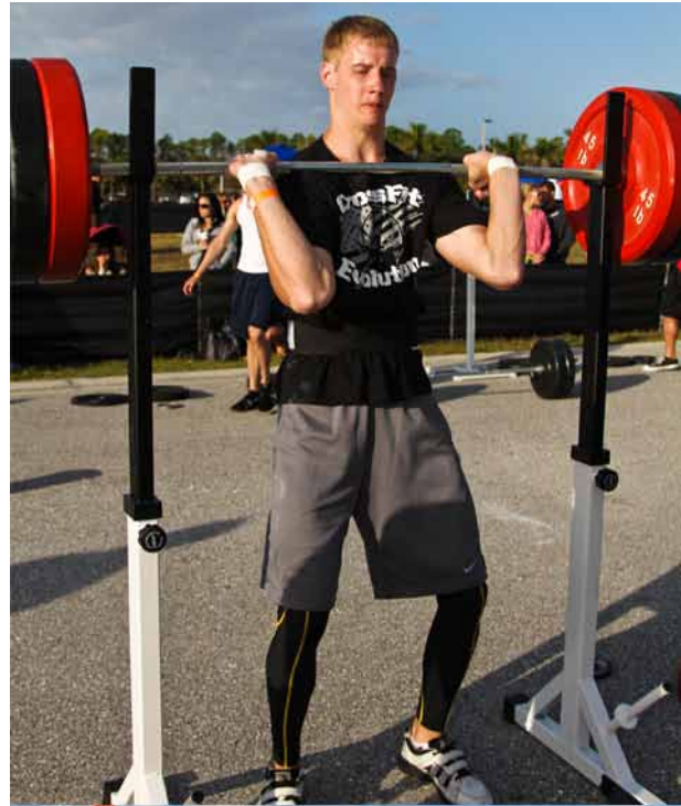
Omar Torres/Omar Torres Photography

Power cleans and front squats Full cleans Jerks from the rack Back squats Shrugs with a clean grip