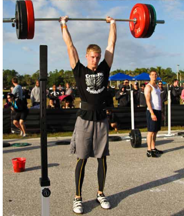
Rack jerks give an athlete a chance to focus on the jerk without having to go through the struggle of a heavy clean first.