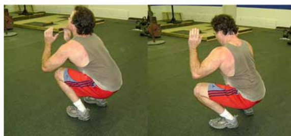
A comparison of the effects of the active hip position and the knees-forward position on the lumbar extension of 2 people at the bottom of the full squat.