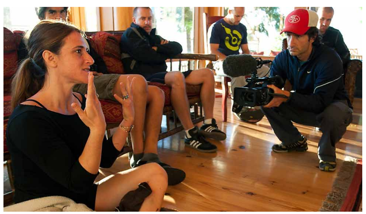
Ignore the perfectly squatting cameraman. Sit tall, relax and bring your attention back to your breath.