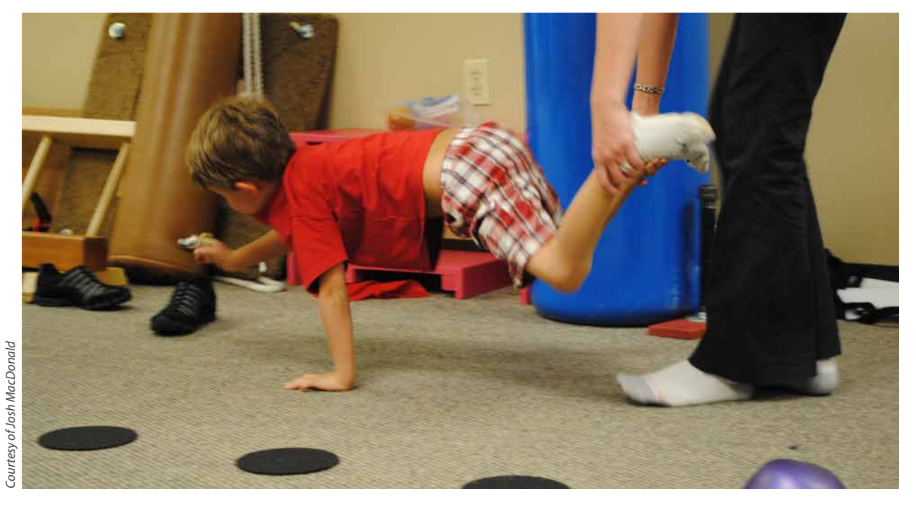
Wheelbarrow walking works on both coordination and strength. It can be graded by holding the child's knees or thighs.

CrossFit is the use of constantly varied functional movements performed at high intensity. For most of us, this means spending some time becoming competent at mechanics but focusing mostly on consistency and intensity.