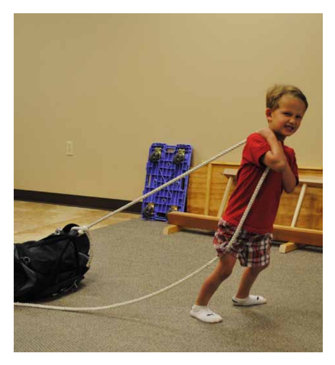
This 50-lb. bag provides an external load that requires midline stability and body awareness to pull and drag.

Through the progress seen in quarterly goals, I have been able to track the benefits of a CrossFit program with my patients. While I do work on a lot of areas beyond the CrossFit approach (i.e., self-dressing and handwriting), I have been able to track the benefit of CrossFit on both the predicted areas and some unexpected gains. For example, many of my patients develop improved coordination and awareness of their body. As mentioned earlier, these kids were clumsy and fell a lot, but a CrossFit approach helped them reach goals like: Patient will demonstrate motor planning and body awareness sufficient for completion of a 3-step obstacle course without falls or loss of balance, 90% of trials.