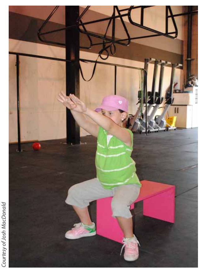
The bench gives a specific reference point for finding the bottom of the squat.

Learning the squat-width stance, and holding it, requires more midline stability and body awareness than some of these children have. Once a child can hold the top and bottom positions for 3-5 seconds each, I move on to the ability to slowly lower to the bottom of a squat without collapse. To accommodate this I use a simple bench placed behind them as a target and a security against falling. Initially I allow them to actually sit on the bench to give them a more firm understanding of the bottom position. This prevents them from bottoming out and squatting too far down without stability. All of this is done with the use of "butterfly hands," as taught in the CrossFit Kids class and CrossFit Journal.