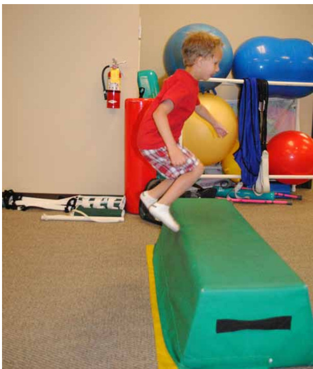
This is a 12-inch box jump and can be used for challenging the child's power and coordination while stressing the cardiorespiratory system.