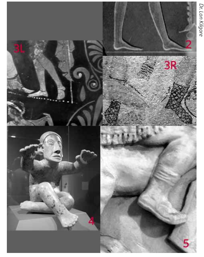
Figure 2: Pre-Christian Egyptian artifacts illustrate bare feet (as depicted here) or sandals as typical footwear. ( Photographed at the Dallas Museum of Art )

Semblances of what we know as the shoe appeared no less than 5,300 years ago. Preventing cuts or frostbite represented an amazing advance, but today we would perceive those early shoes as very low-tech solutions to simple problems. From their first appearance, sandals and wrappings for the foot only varied in materials and construction, not in elementary structure or purpose.