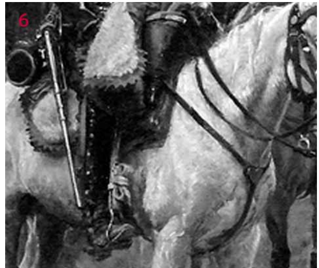
Figure 6: The boots worn by the Hussars influenced cavalries throughout Europe, and heeled footwear remained common following their introduction. Equestrian events such as horse racing used, and continue to use, low-heeled boots.

A second possible origination for shoe heels is attributed to the Hungarian Hussars (mounted military troops) somewhere during the 15<sup>th</sup> century (compare figures 5 and 6). It is surmised that the heeled boots they sported were designed specifically to add stability and control to the foot-stirrup interface. An astute student with a cowboy background once surmised that the heeled boot would also enable the rider to "kick the crap out of foot soldiers." The art of the era is replete with depictions of Hussars in heeled boots.