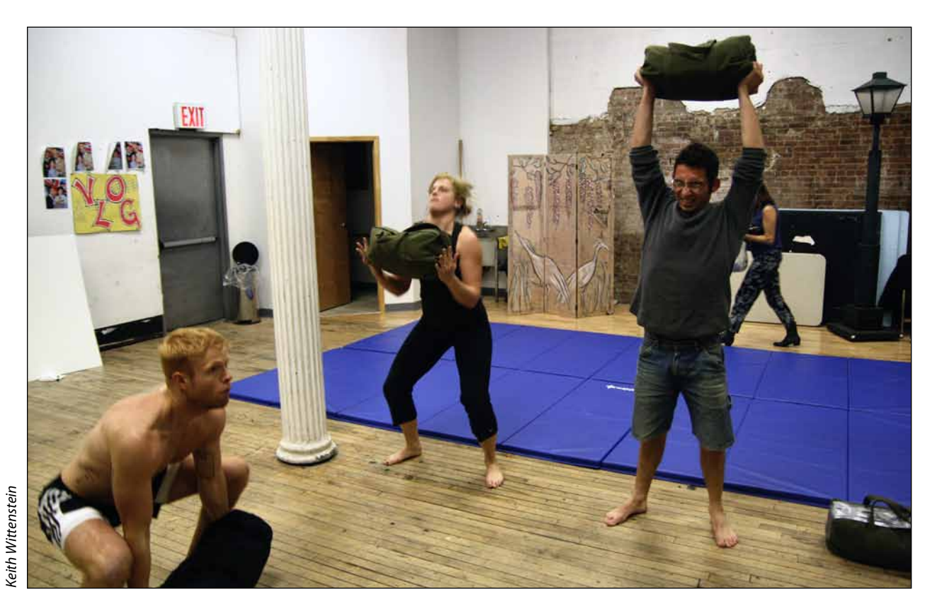
Hard up for equipment? Sand is certainly cheaper than steel.

Sandbags bridge the gap between the weight room and the real world because they aren't perfectlybalanced, calibrated and easy to grip.