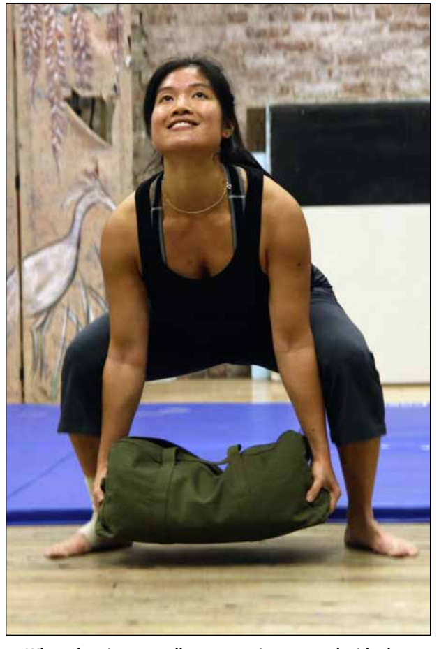
When cleaning a sandbag your grip may not be ideal, so consciously avoid the temptation to curl it up with the arms.

Exercises such as planks are great for static core strength. You can make this type of training more functional by performing standing drills that challenge static core strength. Front squats are a great example. The trunk has to resist the forward flexion of the body under a load while the body is moving. We can take this to another level by performing sandbag shoulder squats. This movement is based on the same principle as the front squat but loads just one side of the body. The athlete is challenged to resist rotating, bending forward and bending to the side.