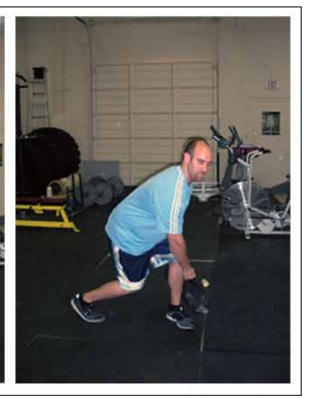
The half-moon snatch is a great sandbag exercise that includes strong concentric and eccentric components.