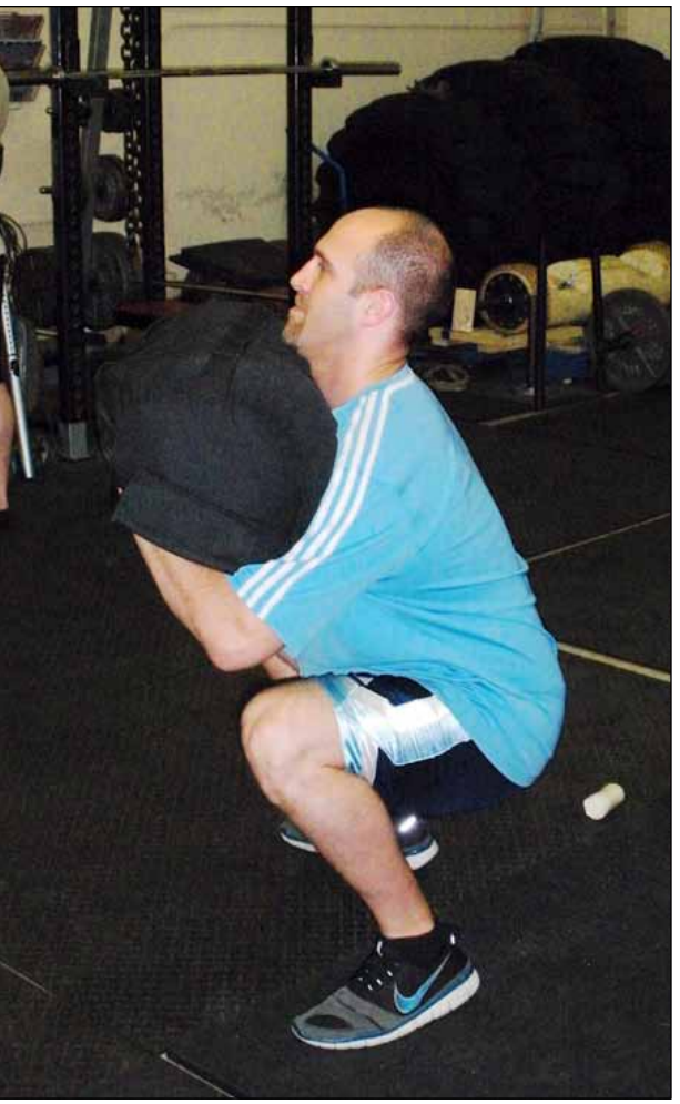
The rack position for a sandbag clean requires the bag to rest on the biceps and anterior deltoids.

get its benefits while working on flexibility. The sandbag front squat would be performed with the rack position of the clean. Other variations include the classic Zercher squat (bag in the crooks of the arms, with the elbows lower than in the rack position for the clean), and the bear-hug squat (holding the bag vertically in front of you).