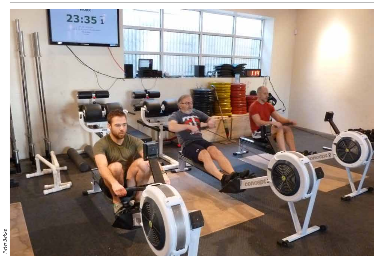
Members of TwinTown CrossFit taking the William Tell Overture 1K Rowing Challenge.

There are many things I love about CrossFit, and a few things I hate. Among the latter are, of course, burpees. But everyone hates burpees. But I have a particular loathing for something I suspect is loved, or at least liked, by most: the music.