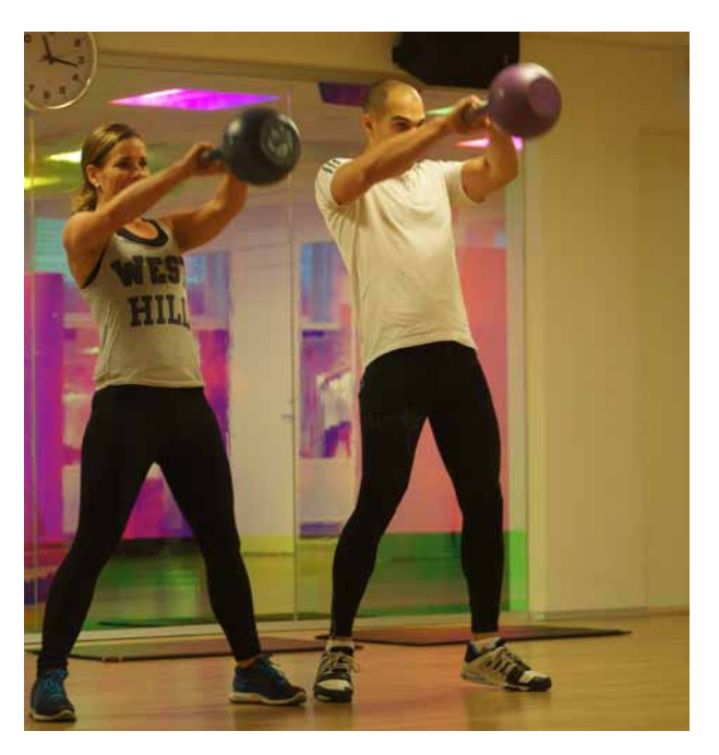
Mental toughness means fighting against negative thoughts and emotions in order to finish according to plan.

To explain, I'll first have to explain the medical model of solving problems.