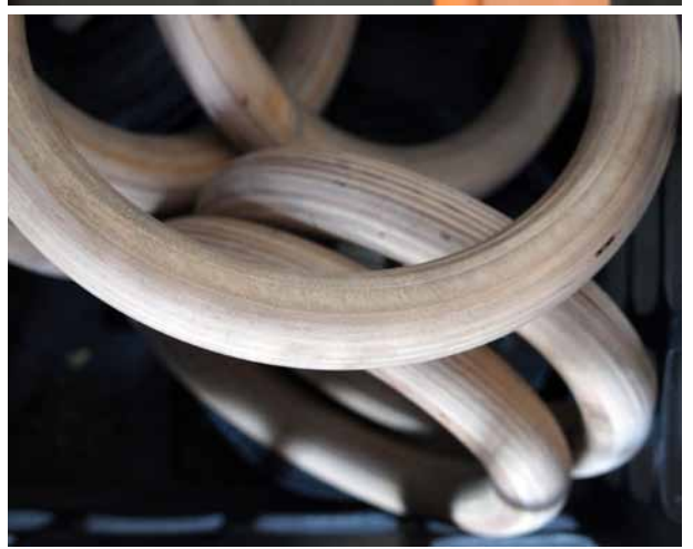
The equipment at a CrossFit box is simple, effective and multi-functional.

Thankfully, it's also rather reductive in terms of programmatic requirements. Elegant in the mathematical sense, the nomenclature of the word "box" should suggest this simplicity. It is a space intended for temporary occupation where few things are fixed. After the permanent racks and other fixtures are put into place, it is an open space that can accommodate a wide range of human movement.