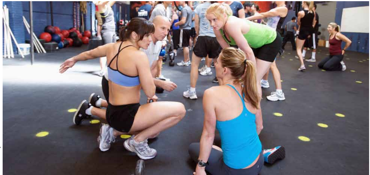
Setting reasonable goals and then striving to accomplish them is a rewarding pursuit that keeps training intense and fun.

The final point is perhaps the most important but least understood: a goal must contain a time frame that is realistic and achievable while at the same time providing the athlete with a certain amount of challenge and motivation. A goal set too far in the future will lack the urgency and fail to create the internal fire needed for accomplishment. On the other hand, too short a time frame may lead to discouragement and despair.