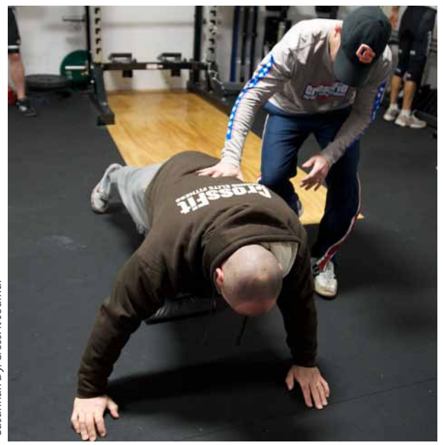
Athletes are very impressionable during workouts. Good trainers take advantage of that and help bring about outstanding performances.