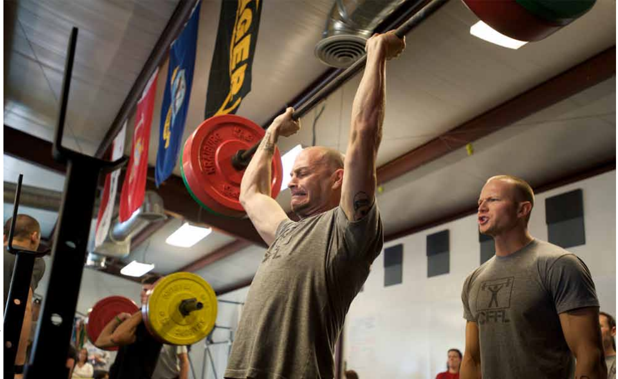
A good coach always uses positive language so athletes never let negative thoughts enter their minds during a workout.

Second, a goal must be expressed by the coach and athlete in the positive tense. In order to maximize human athletic potential and harmonize the mind-body connection, coaches must teach their athletes the significance and power of positive expression. The conscious and subconscious brain will either promote or inhibit athletic performance. If I tell myself consciously, "I don't want to fall off the climbing rope," my subconscious brain in fact hears, "I want to fall off the climbing rope." This is because the subconscious does not hear the negative tense. By telling yourself what you don't want to manifest, you actually create a blueprint for exactly what you intend to avoid. The key lesson for coaches, therefore, is to keep their athletes in a constant state of positive affirmation of the goal's desired end state.