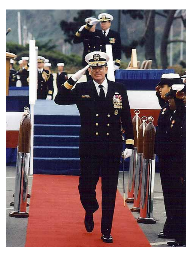
As a rear admiral in the U.S. Navy, Center had commanded warships and thousands of crew, but at age 63 he found he couldn't get up off the floor.

In 1989, I was commanding the cruiser USS Reeves; we were on our third trip to the Persian Gulf during the Iran-Iraq War. Eleven laps around the deck made a mile, and I regularly ran three miles at the start of every day. One morning, after easily completing three miles just the day before, I could barely manage a couple of laps. With a war going on, it was a stressful environment, and I thought I might've been