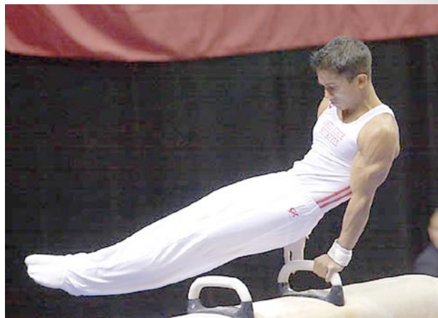
Our use of the term “gymnastics” includes all activities where the aim is body control.

While developing your upper body strength with the pull-ups, push-ups, dips, and rope climb, a large measure of balance and accuracy can be developed through mastering the handstand. Start with a headstand against the wall if you need to. Once reasonably comfortable with the inverted position of the headstand you can practice kicking up to the handstand again against a wall. Later take the handstand to the short parallel bars or parallettes ( http://www.american-gymnast.com/technically_correct/paralleteguide/titlepage.html ) without the benefit of the wall. After you can hold a handstand for several minutes without benefit of the wall or a spotter it is time to develop a pirouette. A pirouette is lifting one arm and turning on the supporting arm 90 degrees to regain the handstand then repeating this with alternate arms until you’ve turned 180 degrees. This skill needs to be practiced until it can be done with little chance of falling from the handstand. Work in intervals of 90 degrees as benchmarks of your growth – 90, 180, 270, 360, 450, 540, 630, and finally 720 degrees.