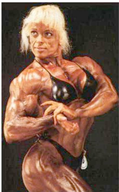
Fit or Grottesque?

The benefits of Olympic weightlifting don't end with strength, speed, power, and flexibility. The clean and jerk and the snatch both develop coordination, agility, accuracy, and balance and to no small degree. Both of these lifts are as nuanced and challenging as any movement in all of sport. Moderate competency in the Olympic lifts confers added prowess to any sport.