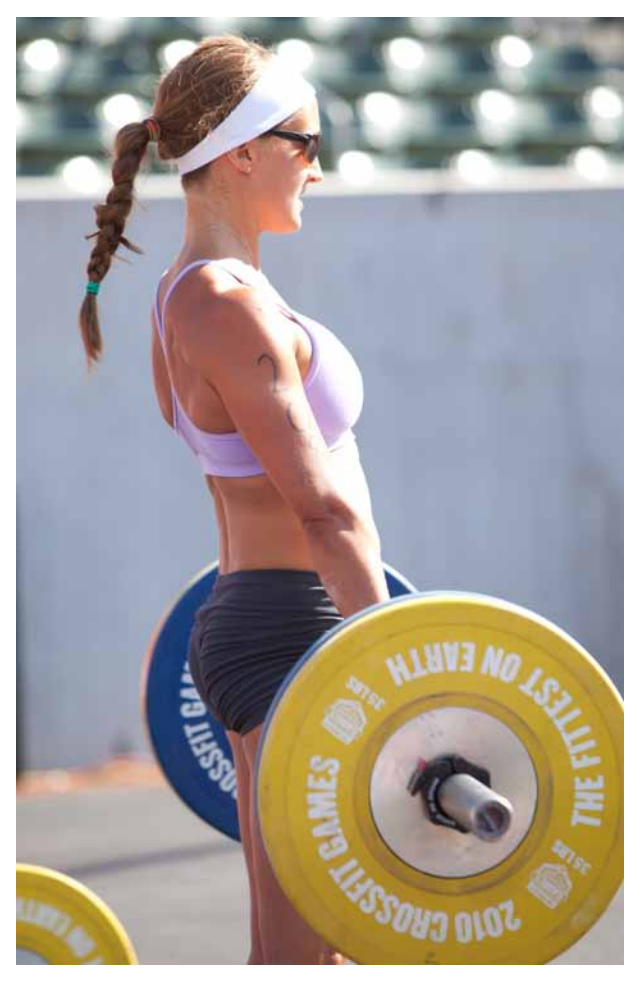
Deadlifts are a great exercise, but Bill Starr usually starts athletes on the bench press, power clean and squat.

I never use the cookiecutter approach. Utilize the heavy, light and medium system to make sure it fully applies to that athlete on an individual basis