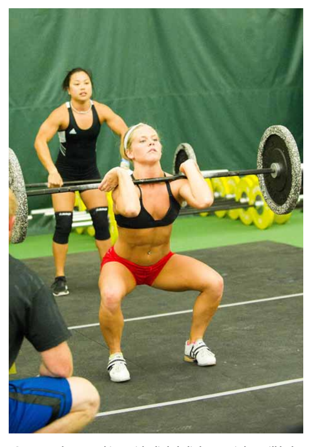
On some days, working with slightly lighter weights will help you beat your records on heavy days.

I had stumbled into the heavy, light and medium system, yet I didn't know that at the time.