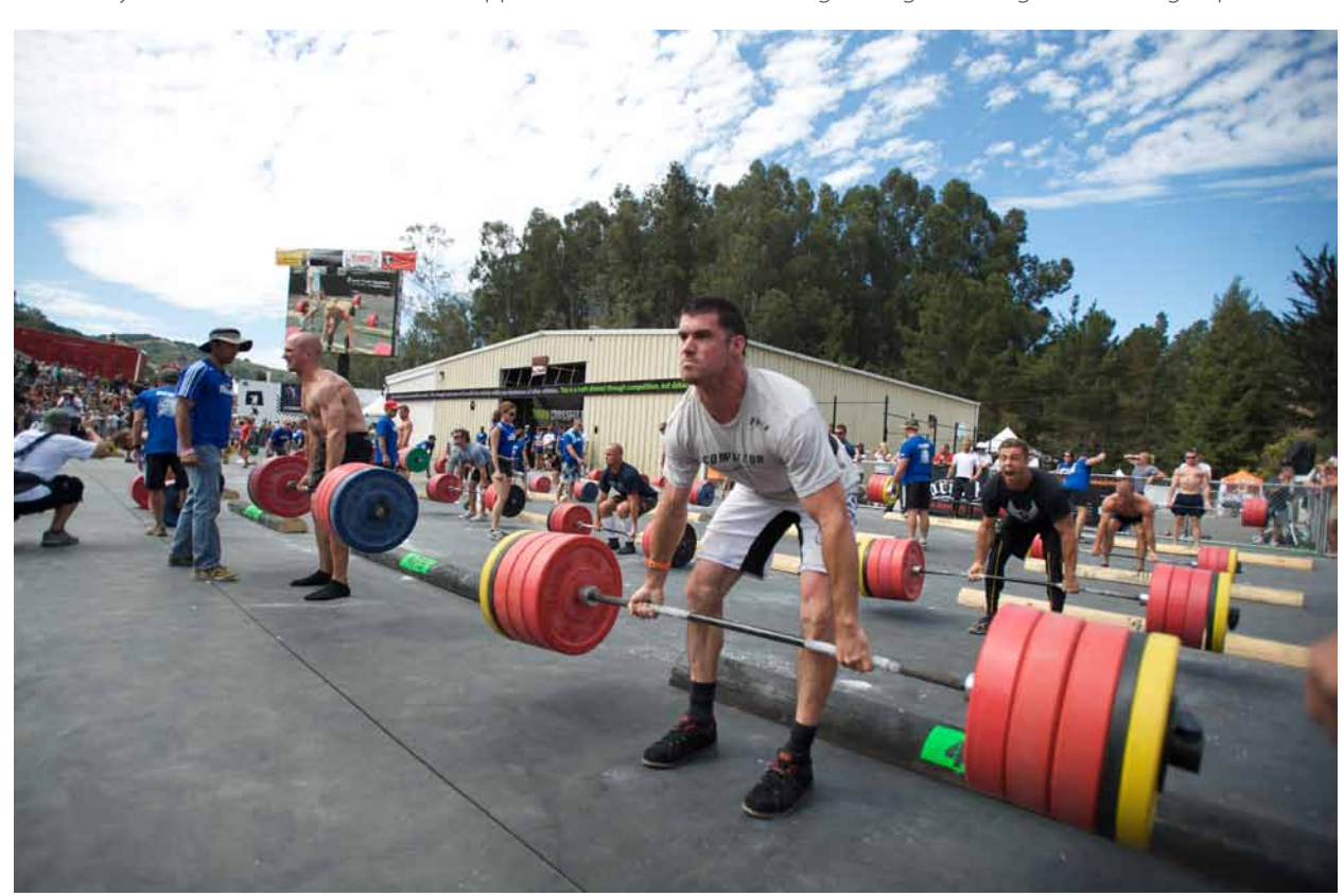
This would be heavy day.

While this may seem to be very light, and it is, it serves a purpose for beginners. These relatively light poundages allow them to concentrate all their energy on doing the movement perfectly. Learning correct form is just as important as moving the numbers up at this level, so it's OK to use light weights during this breaking-in period.