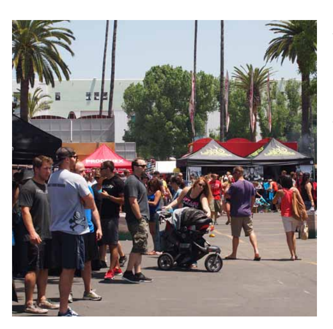
CrossFitters on the lookout for free samples and the latest snatch jokes.

As in years past, the sound of a CrossFit event is awesome. The commentating is stellar and the music is loud. It's the best kind of sporting event I can think of: competition, of course, but also the spectacle of the crowd, complete with families, food, and ... shopping. We all need sustenance and adornment, right?