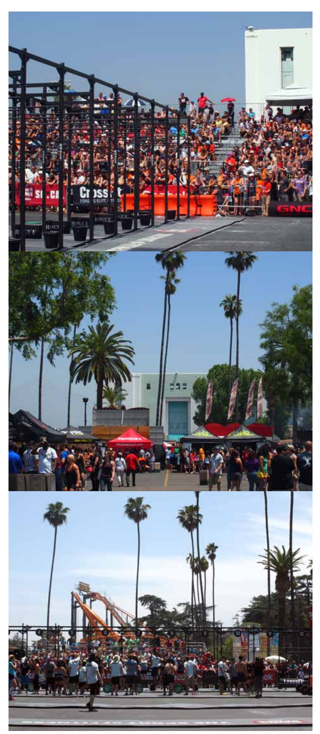
SoCal CrossFit athletes gave it their all beneath the shadow of palm trees and a roller coaster.