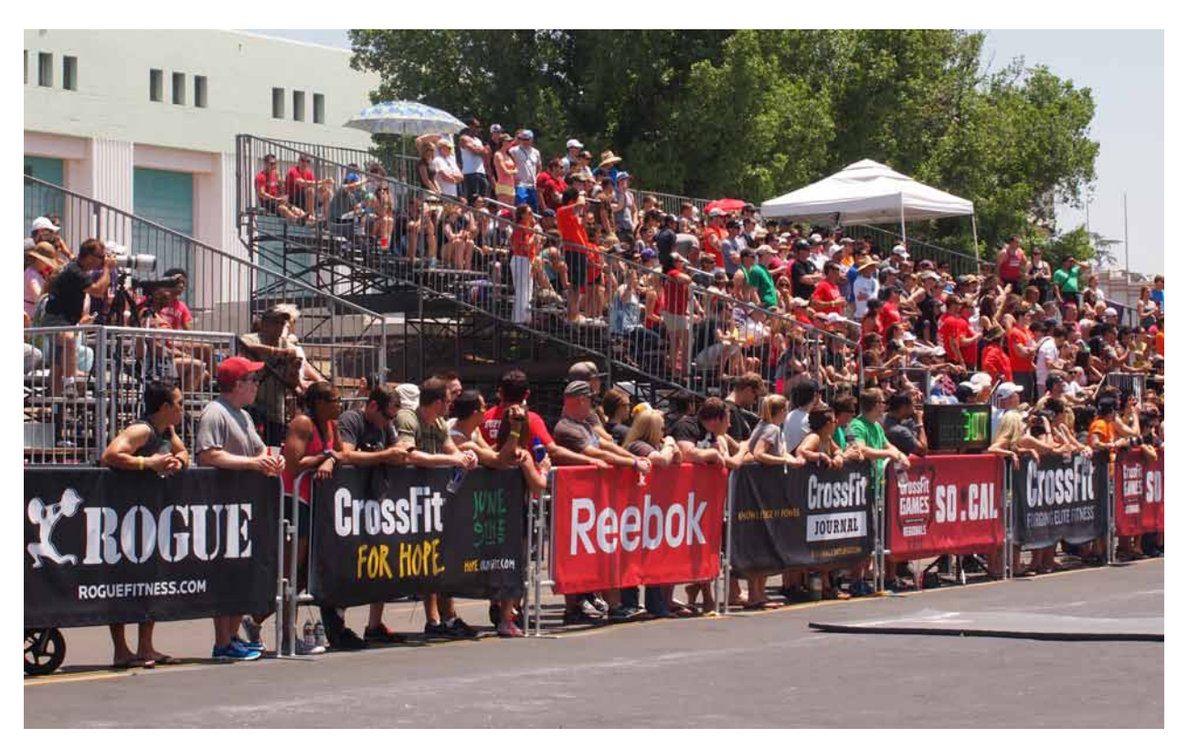
Lack of shade and soaring temperatures didn't deter the spectators or the athletes.