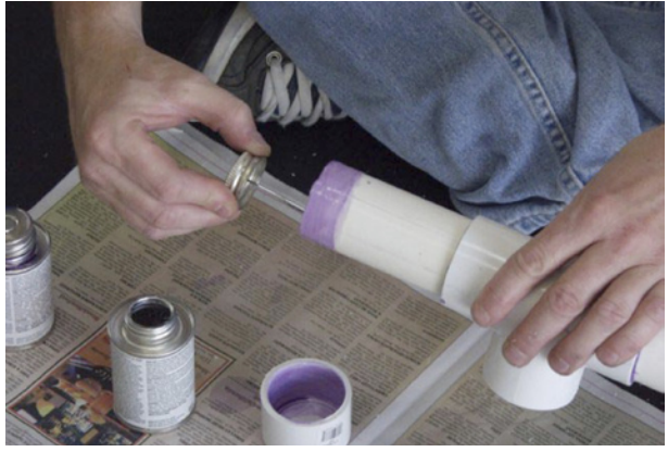
Read the directions for primer and glue carefully. You definitely want a good bond.