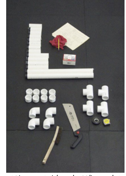
The cut pieces, materials, and supplies, ready to glue.