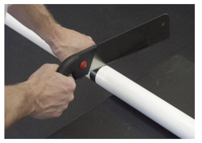
Above: Fine tooth hack saw makes easy work of cutting the pipe.