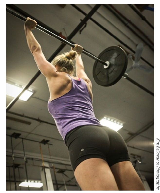
Although not as common as with more core-focused exercises, some women experience orgasms while lifting weights.

Similarly, female orgasmic disorder (FOD) can be found in the Diagnostic and Statistical Manual of Mental Disorders , suggesting the female orgasm is a combination of physical and mental factors. In the article Female Orgasmic Disorder: "I'm Not Able to Climax", both emotional and