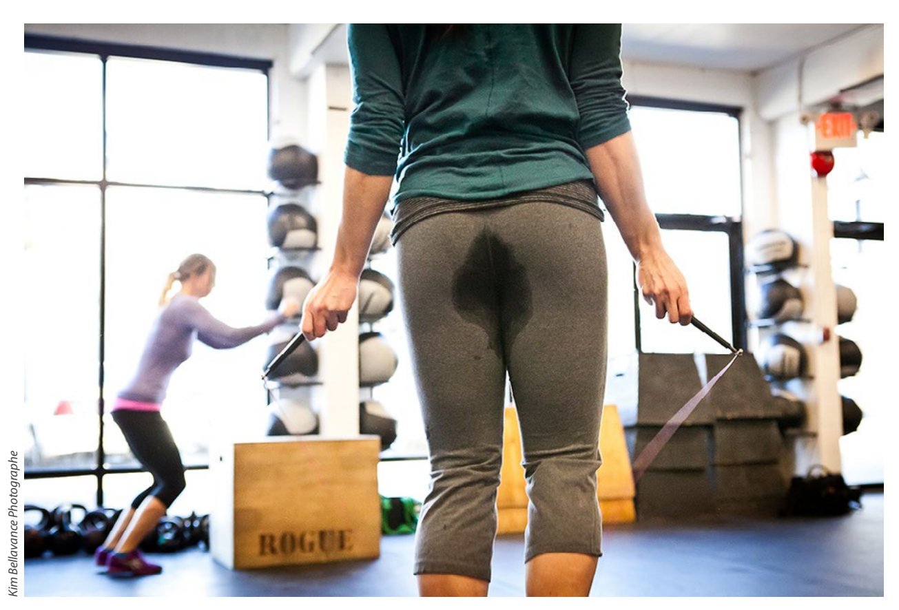
Situations like this might be related to the pubococcygeus muscle, which controls urine flow and contracts during orgasm.