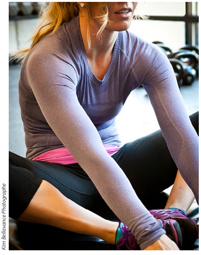
When the WOD Annie becomes interesting: some women find ab-focused workouts bring them to orgasm.