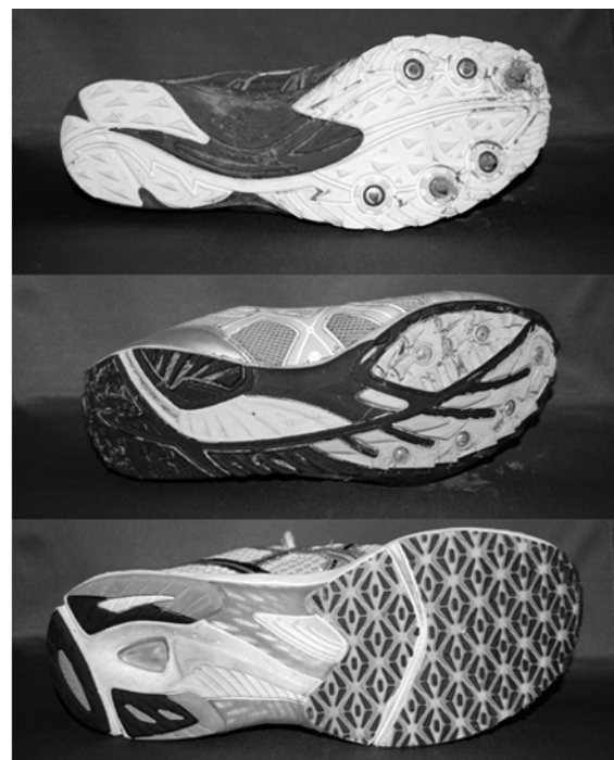
Dr. Ian Kilgore

OK. Let’s consider long-distance runners. Like any athlete who competes in varied environments, these runners will have multiple shoes for racing in specific conditions and for training (Figure 8). A competitive marathon is a very specific environment that produces profound fatigue, and with fatigue, exercise technique decays. I maintain that a “racer” will be able to use correct running technique throughout a marathon with correct training and minimal heel cushioning. However, a “runner” will likely not be so well prepared, and the big, cushy shoes will likely be a godsend of comfort.