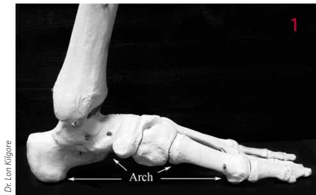
Figure 1: The longitudinal arch of the foot forms an effective supportive and shock-absorbing structure. The transverse arch (running across the ball of the foot) also performs similar functions. An analogous structure would be leaf springs in a car's suspension—quite robust.

When we consider the range of human activity and any possibility of anatomical predisposition to injury, one would assume that during the many millennia of human history, regular advances in technology would either reduce injury rates or improve locomotive function if there was indeed an environmental challenge and need. Strangely, such advances were not seen until the past century or so, a pitifully small segment of human history. Why? We consider shoe design to be a major component of exercise performance today, so why did our ancestors avoid improving shoe design and function? And how do we know they didn't?