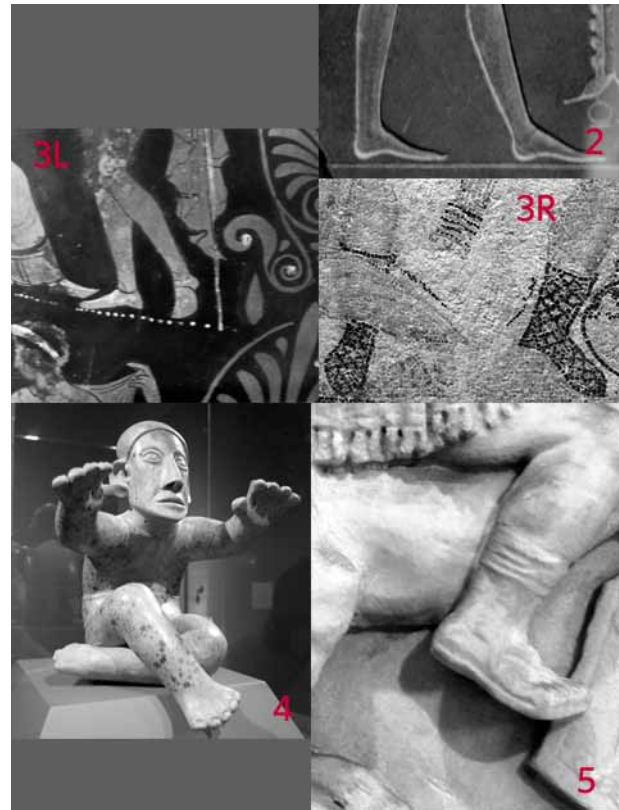
Figure 2: Pre-Christian Egyptian artifacts illustrate bare feet (as depicted here) or sandals as typical footwear. (Photographed at the Dallas Museum of Art)

Semblances of what we know as the shoe appeared no less than 5,300 years ago. Preventing cuts or frostbite represented an amazing advance, but today we would perceive those early shoes as very low-tech solutions to simple problems. From their first appearance, sandals and wrappings for the foot only varied in materials and construction, not in elementary structure or purpose.