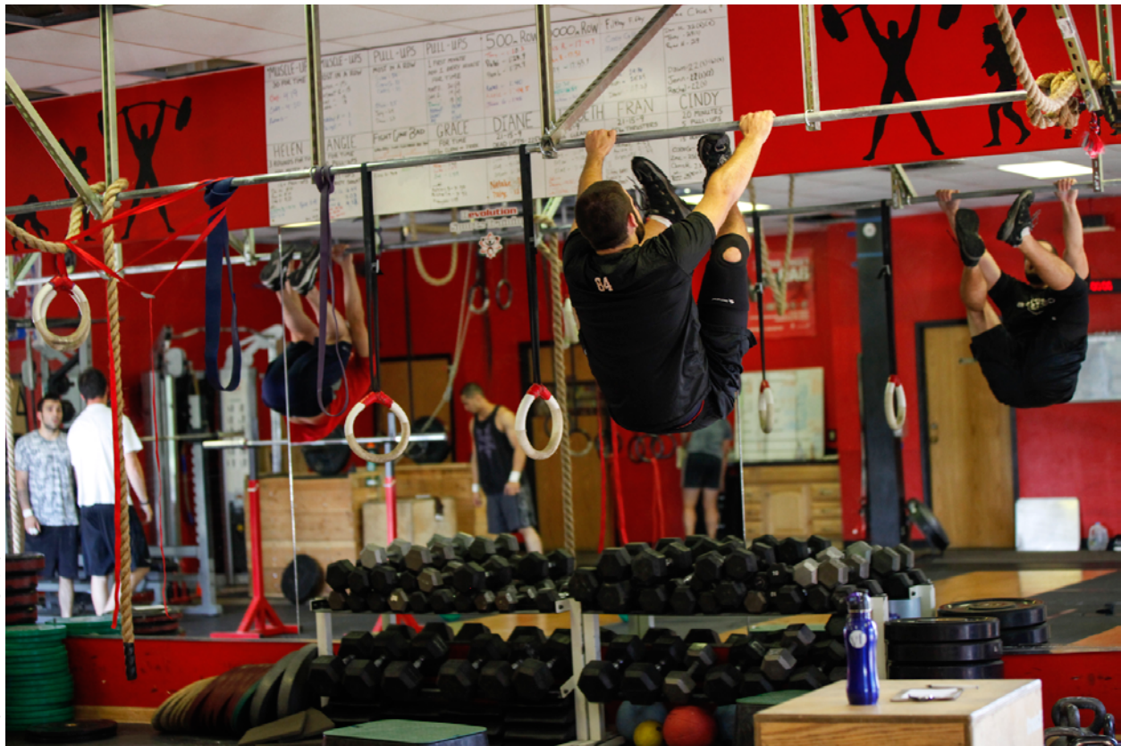
Cheryl Boatman Photography