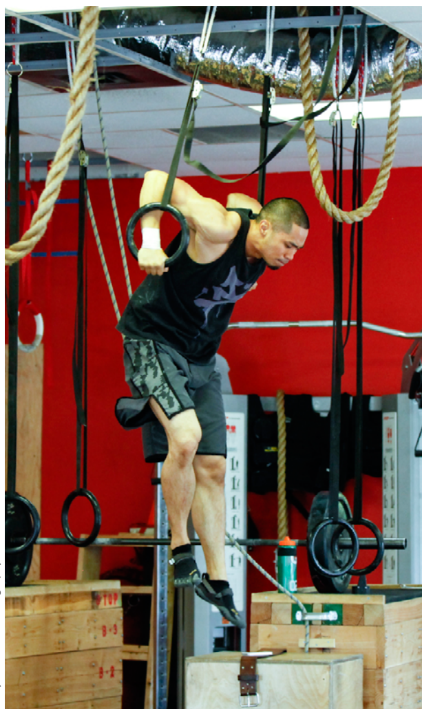
Getting up and over an obstacle using just your arms can come in handy in the wilderness of Alaska.