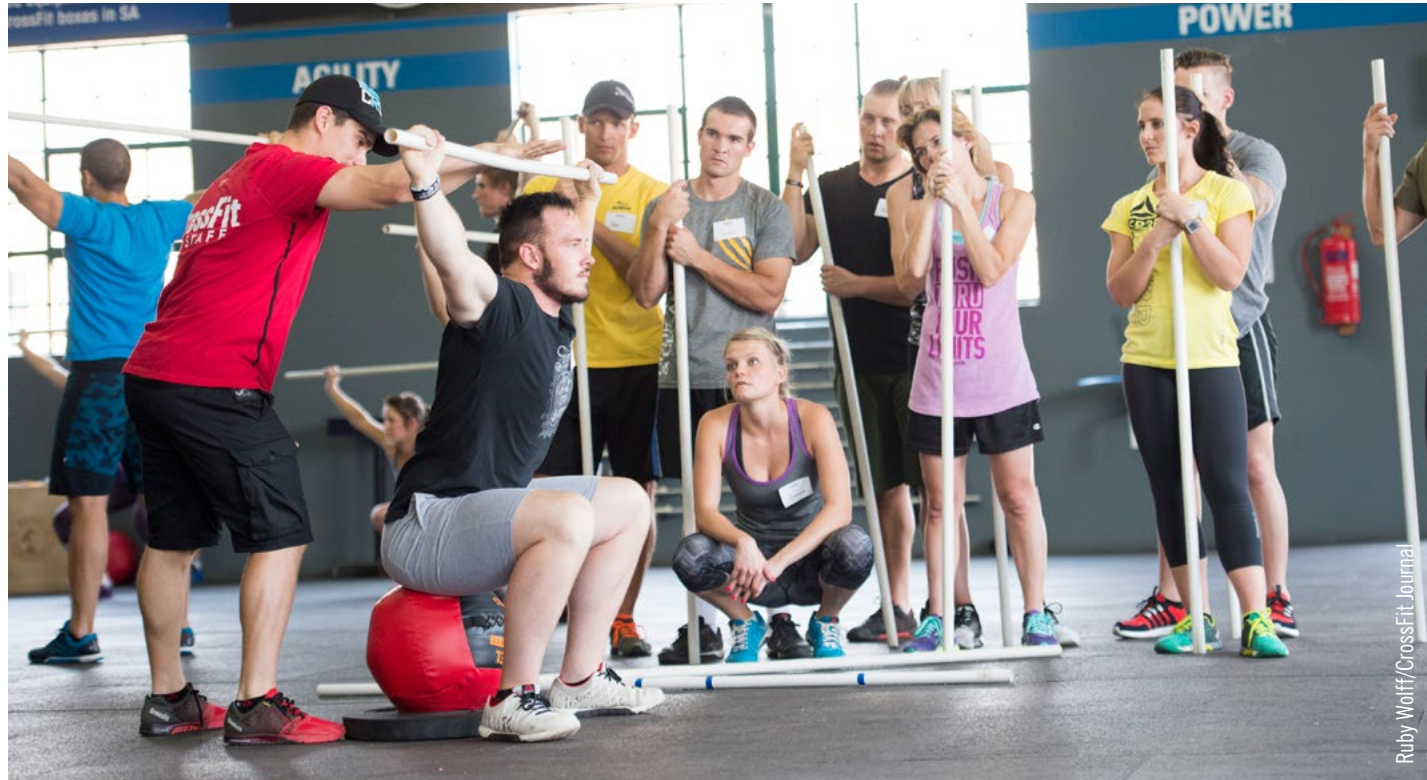
Learning never stops: Watch other coaches and athletes to see what they can teach you.