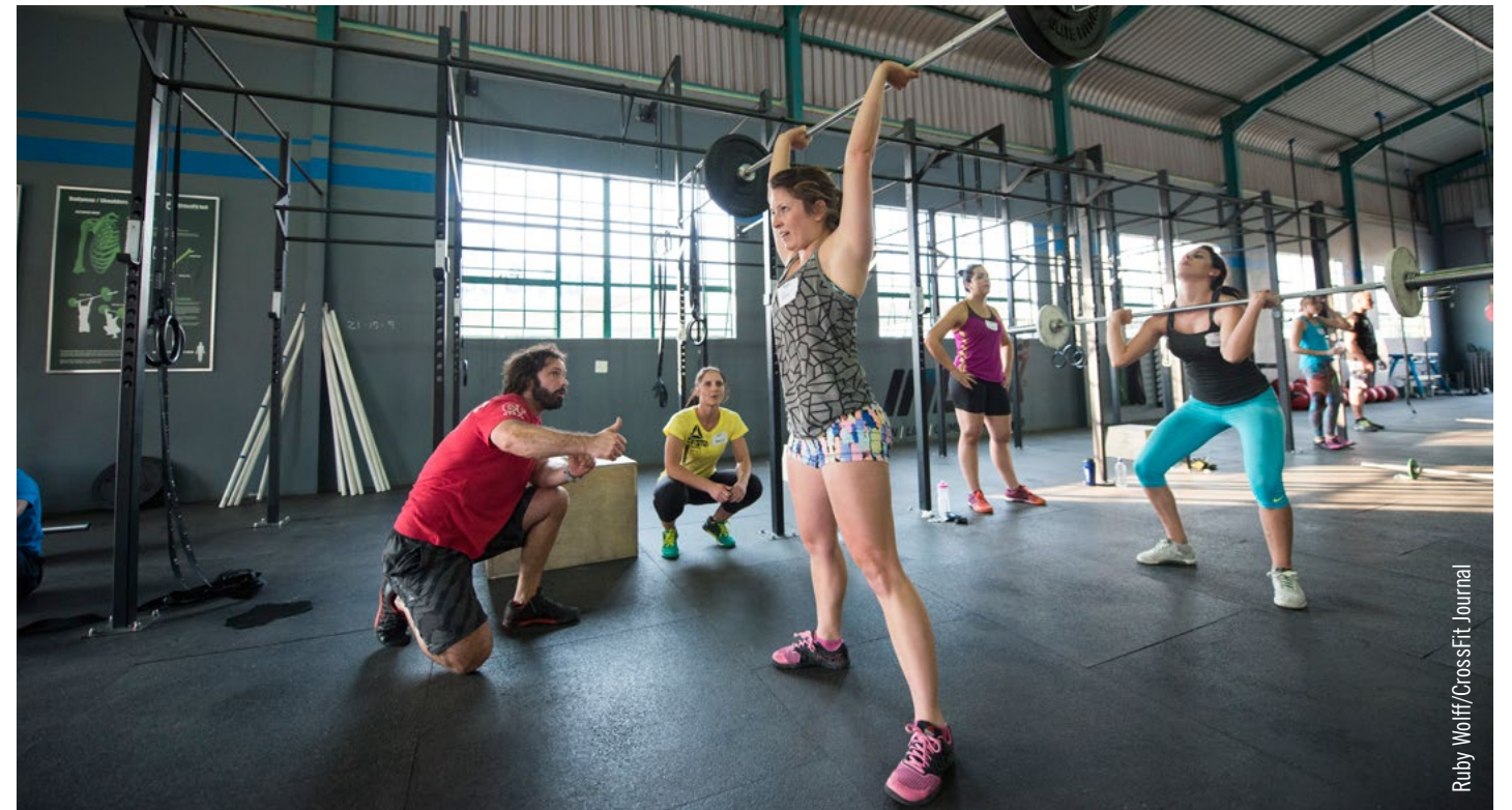
Elite coaches work to improve their presence and attitude, knowing they have the ability to motivate athletes to accomplish great things.