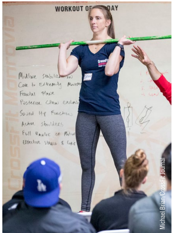
Strive for excellence in every class. Did your athletes improve?