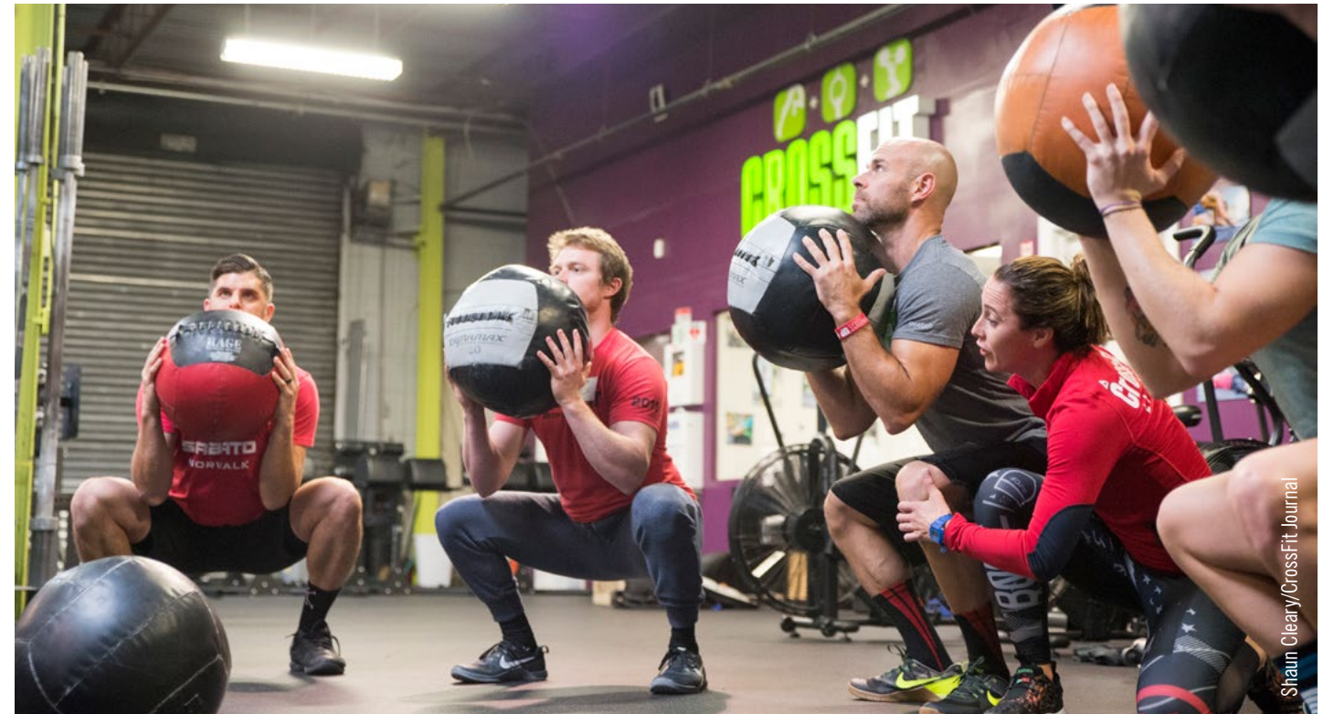
Once a flaw has been spotted, great trainers use a combination of visual, verbal and tactile cues to correct it.

Actively look for opportunities—any opportunity—to address your weaknesses.