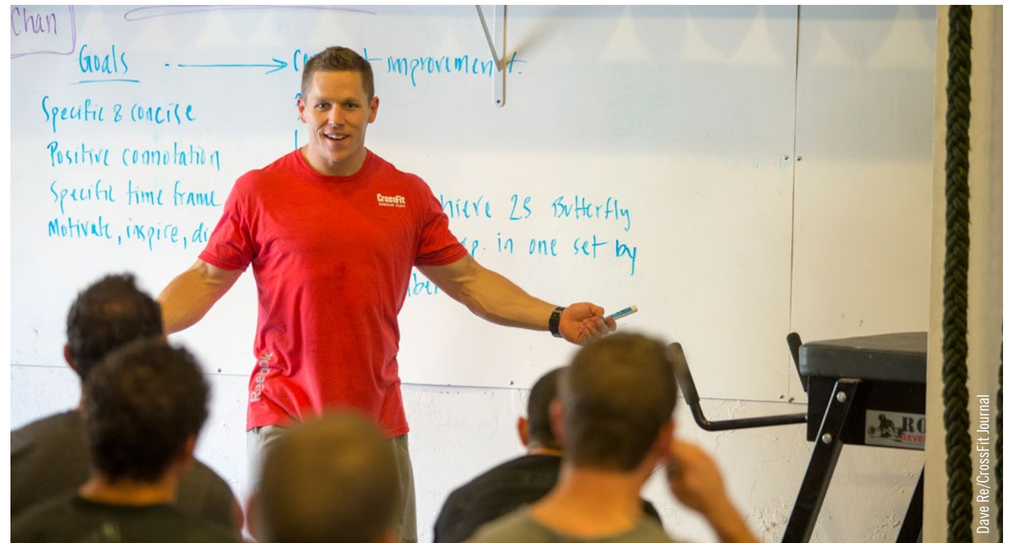
At CrossFit Level 1 and Level 2 certificate courses, Seminar Staff coaches ensure trainers acquire the tools they need to improve fitness.