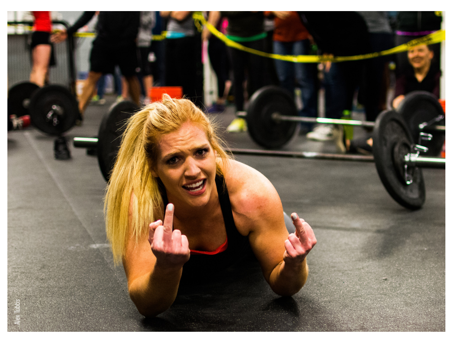
"You said everything would be OK! Why the hell would you say that?"

You're a fine, hardworking human being. You've trained all year, and you're ready. You don't need to worry, so just have fun Strange rituals and behavior identify those who are feeling too proving your fitness among friends. Relax, give your all, smile while you suffer, and cheer for your buddies. Then come back to the gym tomorrow and keep training.