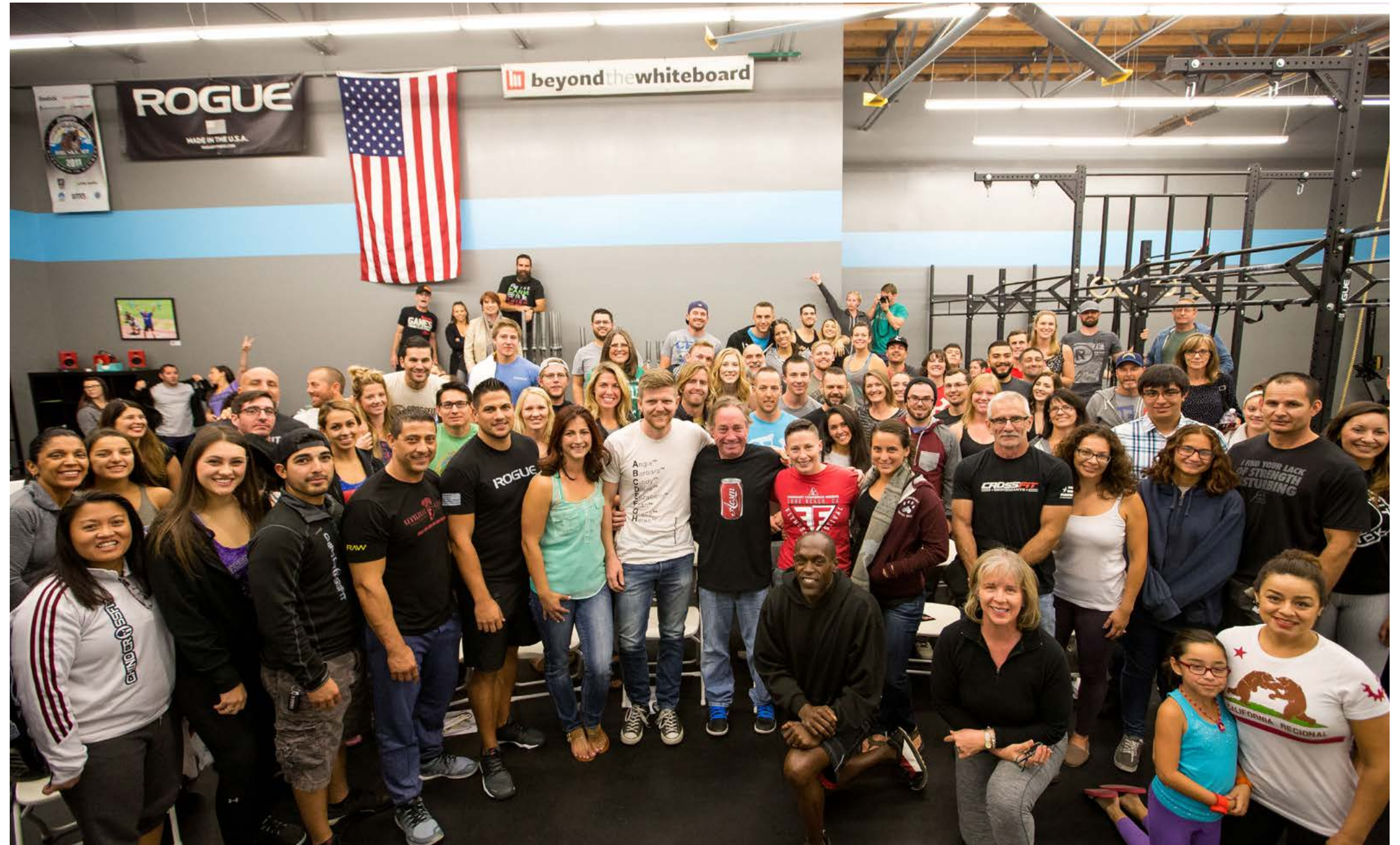
CrossFit Kinnick Ontario—Nov. 8, 2015