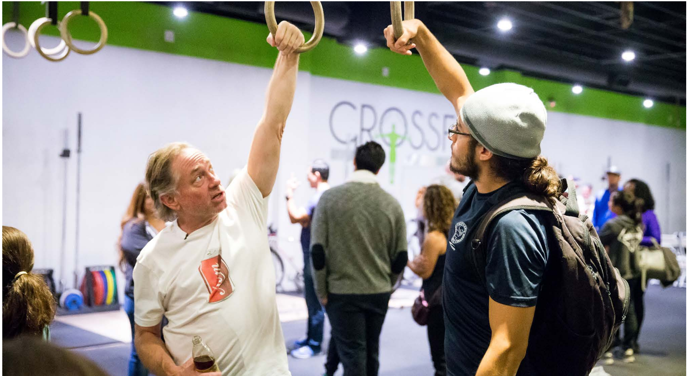
CrossFit Downey—Nov. 12, 2015