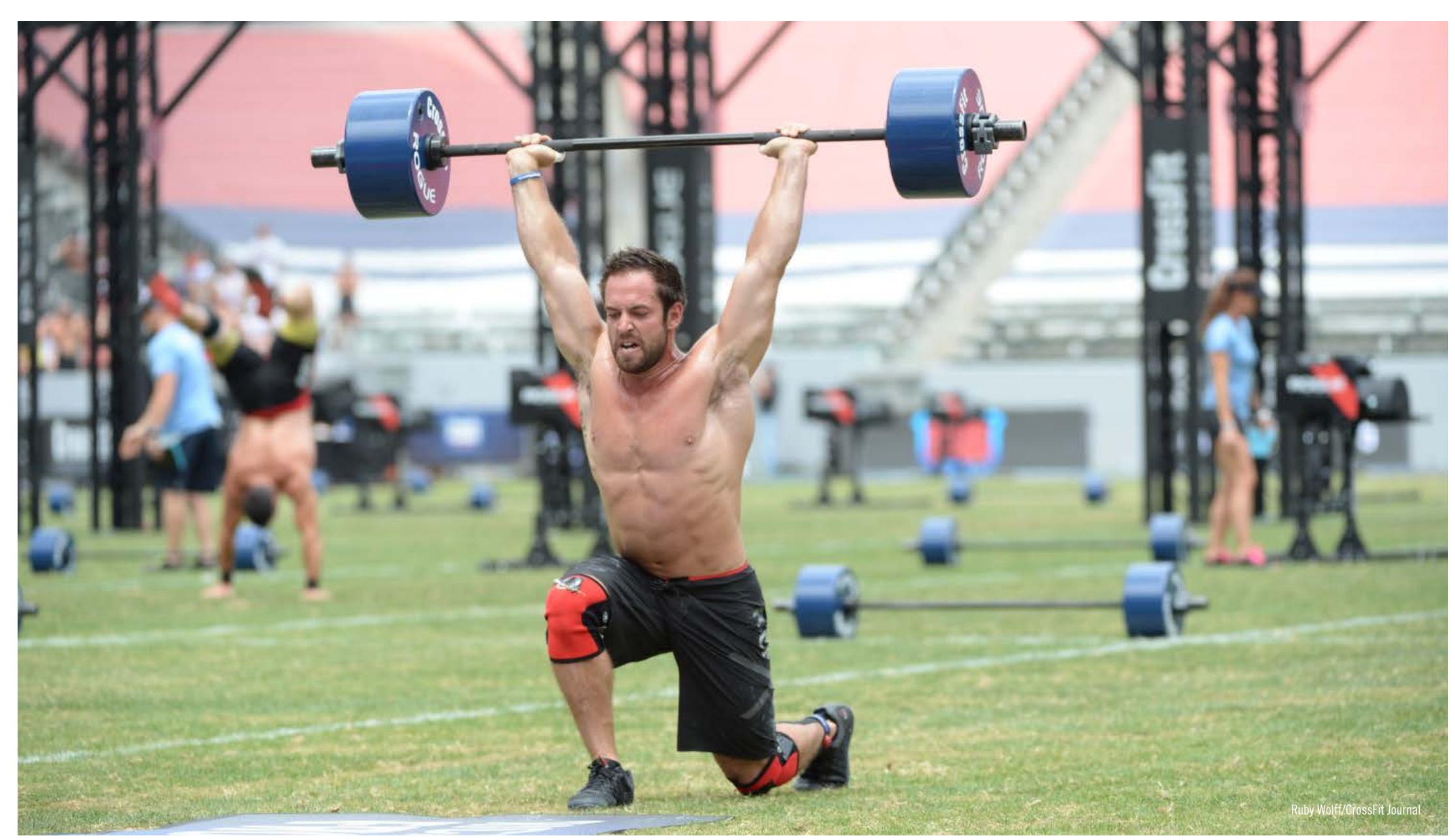
Froning started the final day of competition looking determined and fiery, and he won Midline March by more than 35 seconds.

Such is the life of the man who—with struggle—would later that day become the fittest man on Earth for an unprecedented fourth consecutive year.