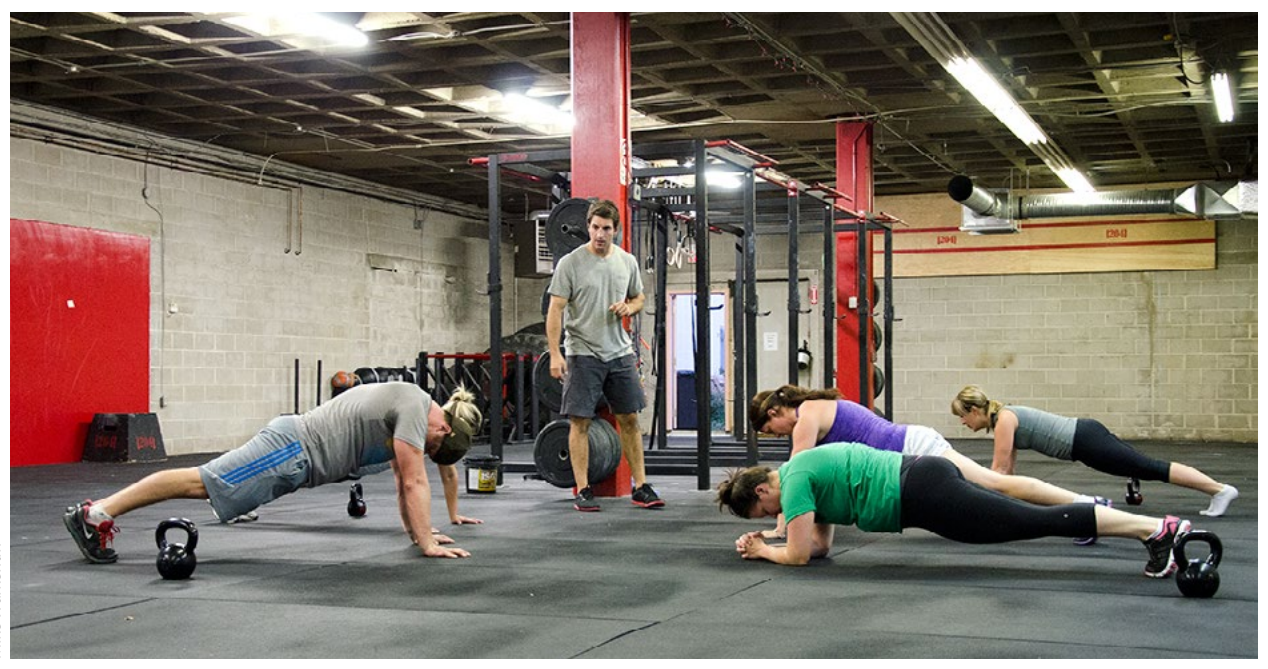
A good coach can scale movements in a variety of ways to make them easier or more challenging.

DogTown offers classes for various ability levels, as well as specialty classes, so athletes who have general physical ability can progress to more advanced skills.