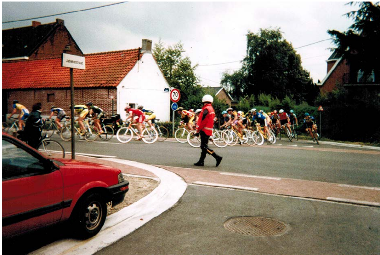
A Belgian kermesse in 1998. King is on the right.

We were blasting through 80 miles of narrow brick streets at speeds approaching 30 miles per hour. There was no chatter between riders, no smiles, no encouragement; just a peloton of lowered heads with the occasional punch thrown if a rider wasn't taking his turn at the front.