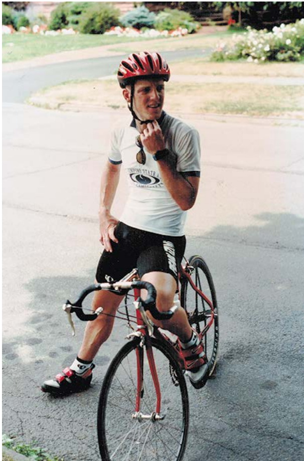
King at 18, after the New York State Championships in 1993.

What the sport of cycling is today was being developed in labs and refined on the roads of Europe in 1998.