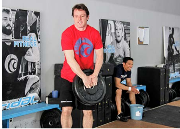
King staying fit without at bike at Tidal CrossFit in Toronto.

The next two years were some of the most enjoyable in my racing career. The races were just good clean fun. I even managed to get in good enough shape to enter a high-level pro race in 2006 that went through my town of Rochester, N.Y.