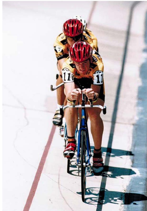
King (in front) during the 1997 college national championships in San Diego.

A couple of weeks before the national championships in Vermont, we went down to southern Colorado for a two-day, three-stage race in Durango. The first stage was