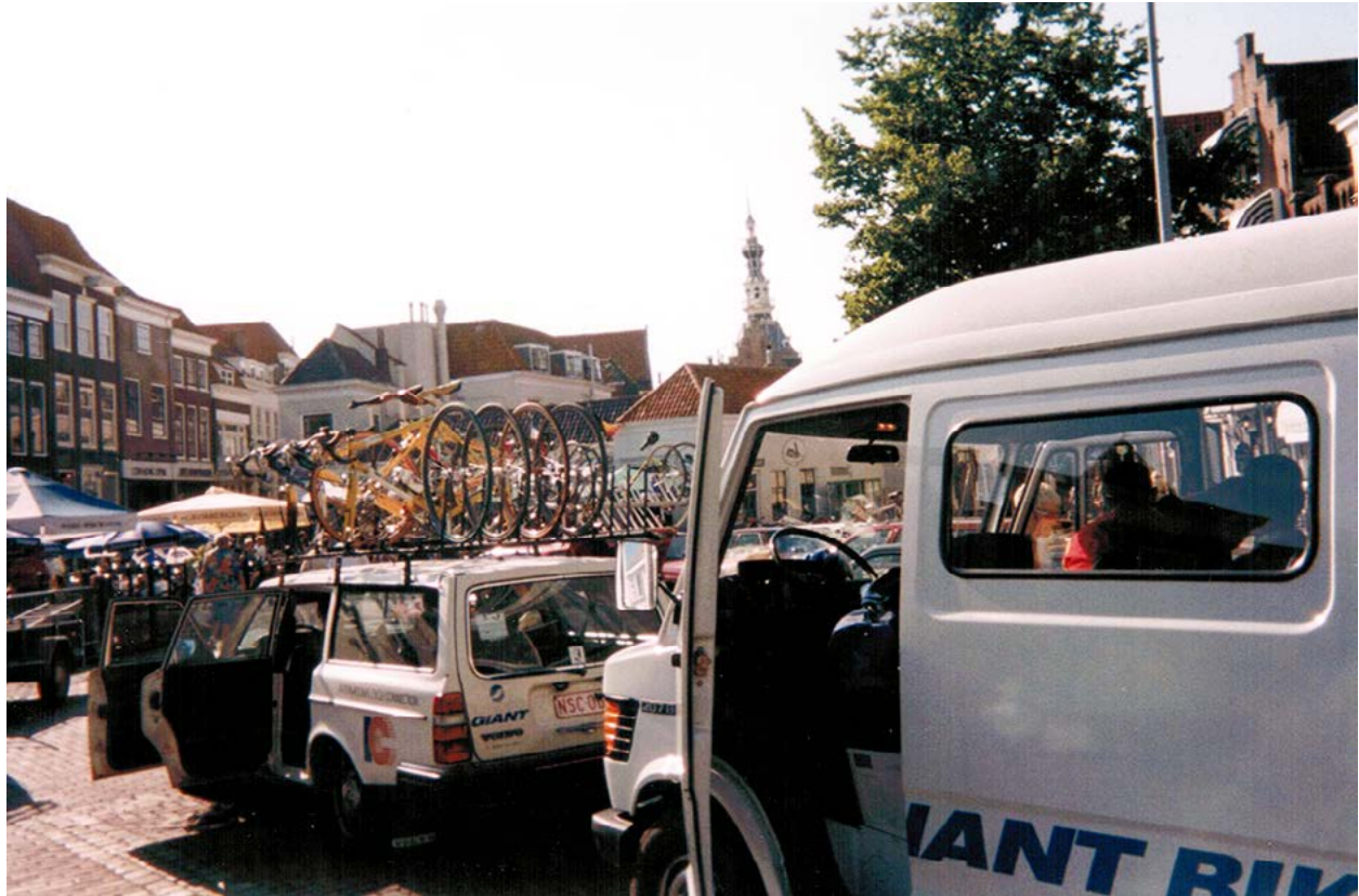
King's team cars at the start of a race in France in 1998.

The older riders told us how to spot users. The everyday drug of choice was amphetamines. It was effective for a short period of time and out of your system within a day or two. If a rider was at the back one day then riding erratically at the front with his eyes bugged out the next, it was amphetamines. It usually took a day or two to recover from an effort like that, so they trailed from the back during the next race.