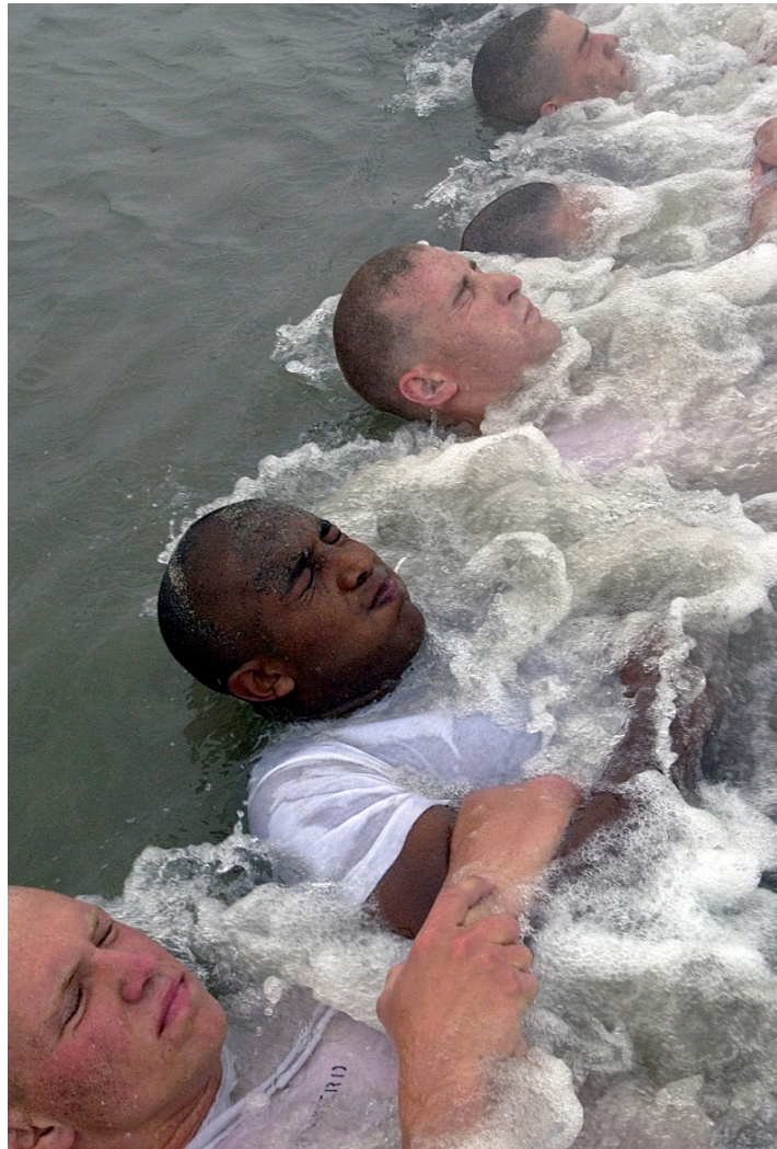
at BUD/S.