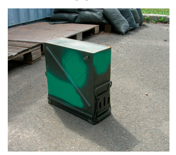
Equipment Annex B