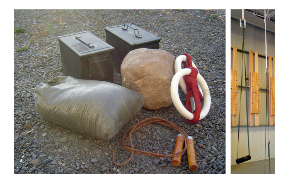
Annex C Exercises