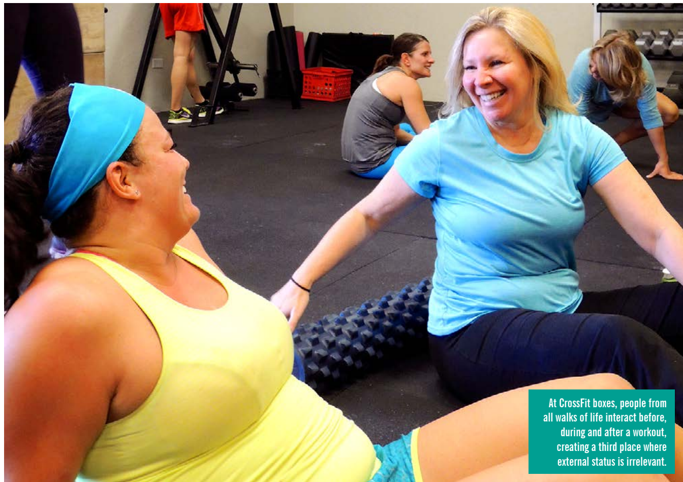
At CrossFit boxes, people from all walks of life interact before, during and after a workout, creating a third place where external status is irrelevant.

“We aimed,” Oldenburg says, “for comfort and well-stocked homes and freedom from uncomfortable interaction and the obligations of citizenship. We succeeded.”