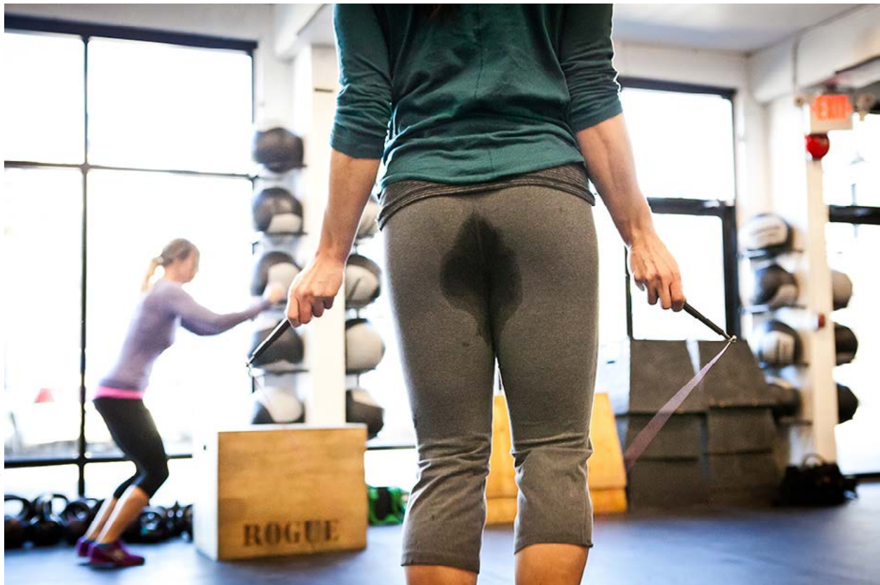
Kim Bellavance Photographie

Situations like this might be related to the pubococcygeus muscle, which controls urine flow and contracts during orgasm.